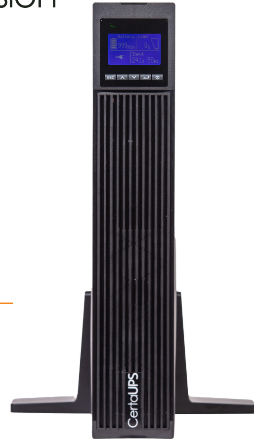
*Image shows 1000VA C450R UPS