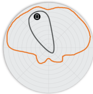
Figure 4. T750 2.4GHz Elevation Antenna Patterns