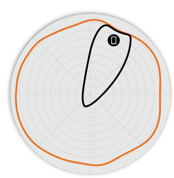
Figure 4. H350 2.4GHz Elevation Antenna Patterns