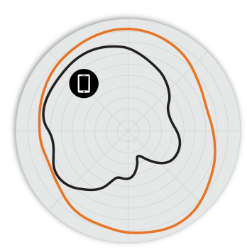
Figure 2. H350 2.4GHz Azimuth Antenna Patterns