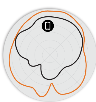
Figure 3. H350 5GHz Azimuth Antenna Patterns